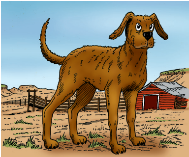
Hank the Cowdog